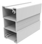
Aluminium handrail profile